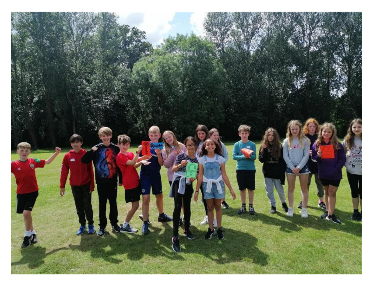
Mapledurham Team Escaped the Room!