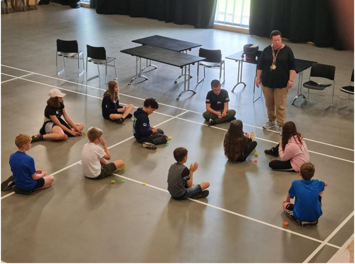
First Aid: Restart a Heart