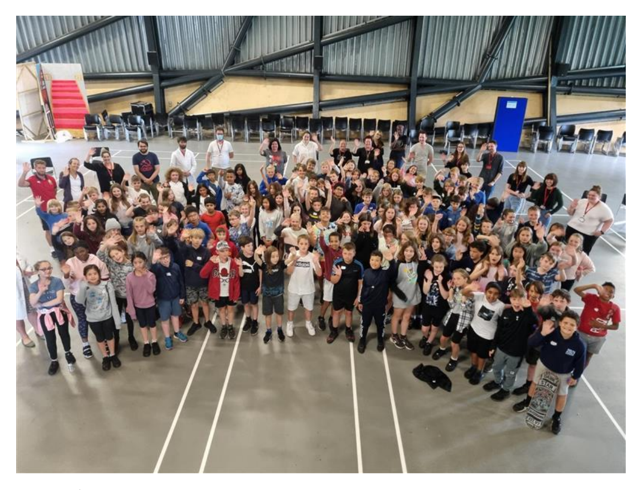
Highdown's Got Talent