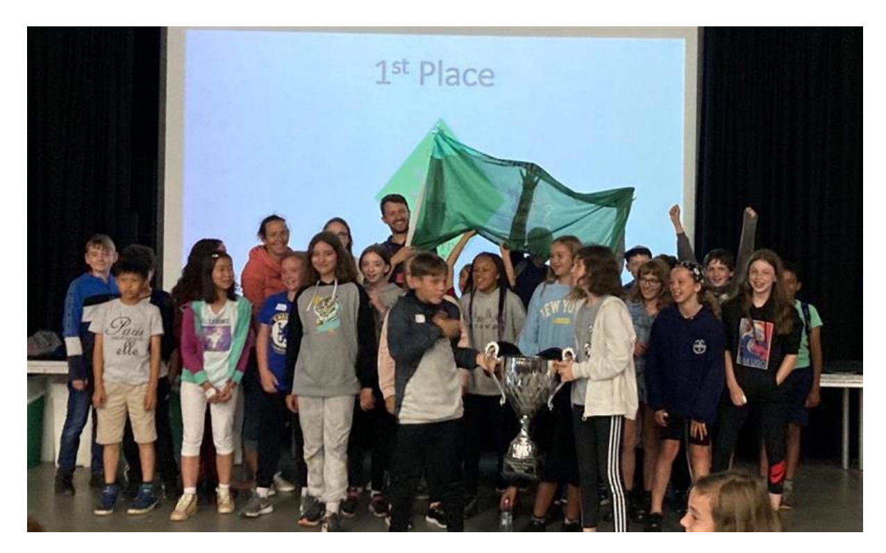
Grove Griffins gain the most House Points across the week!