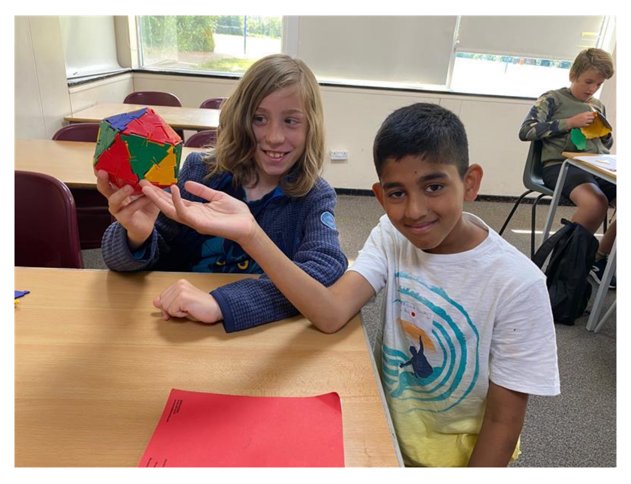
Fun with Maths