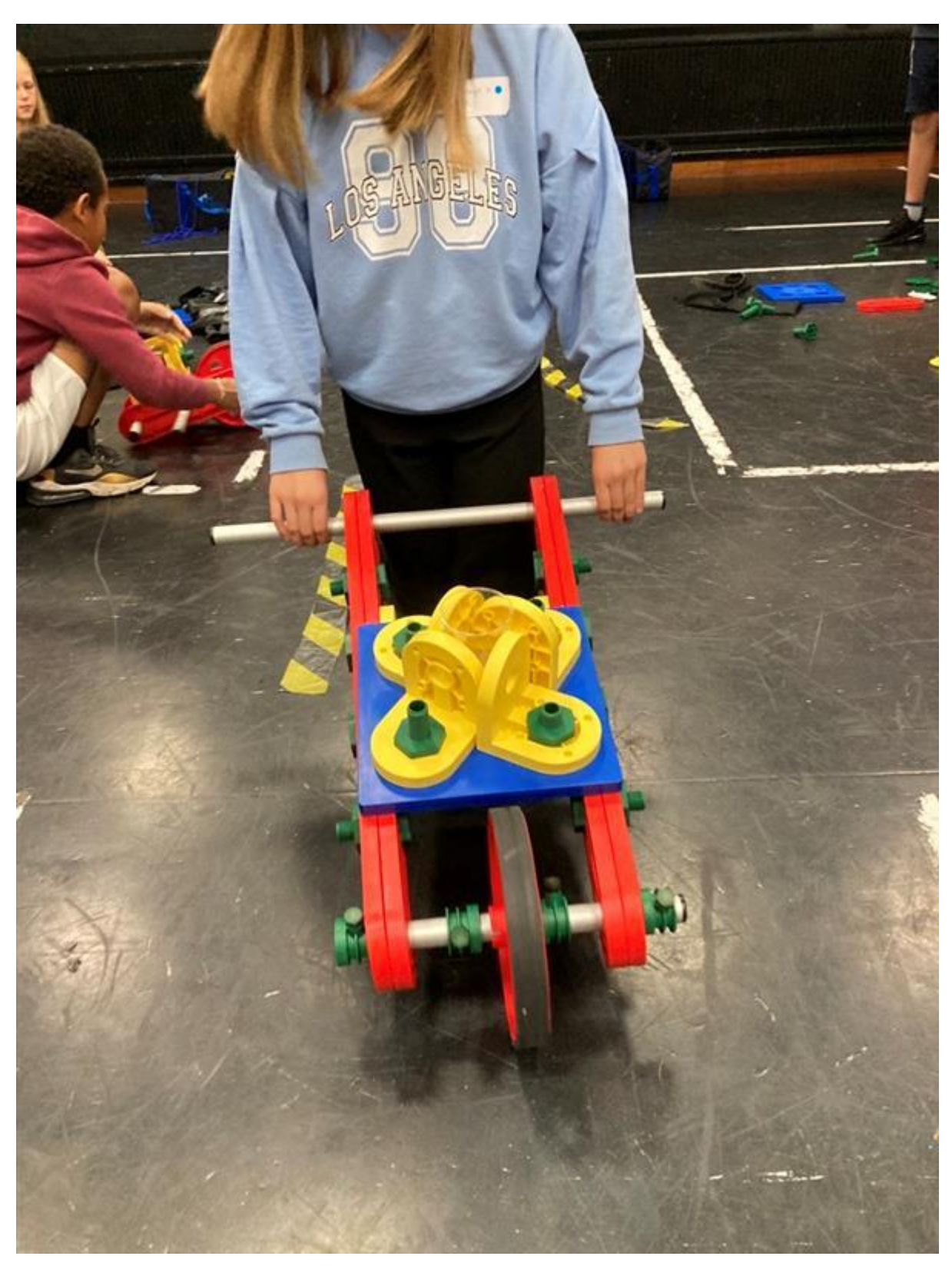
STEM Wheelbarrow challenge with MTA STEM kits