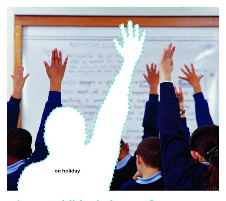
Is your child missing out?

Encourage your child to attend revision classes and other opportunities for support that are provided.