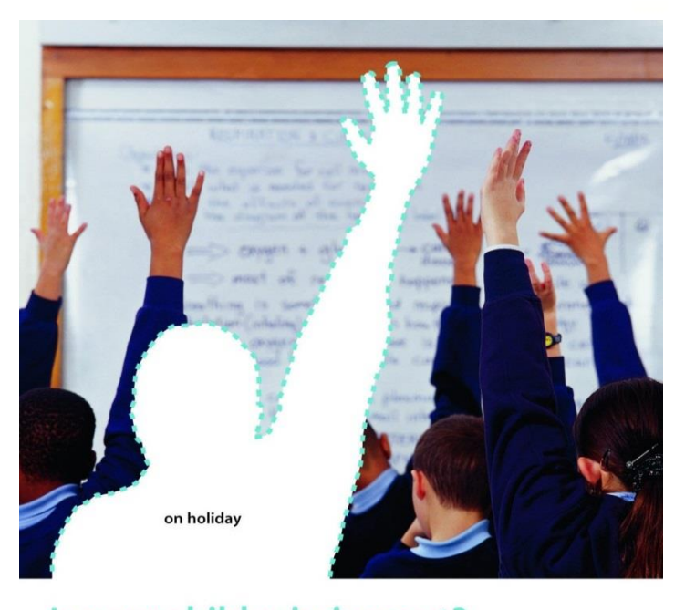
Is your child missing out?

Encourage your child to attend revision classes and other opportunities for support that are provided.