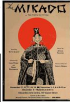
The Mikado (1885)