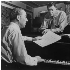
Irving Berlin – Annie get Your Gun (1946)

This period is when the tradition of musicals was truly established in Britain and America. Some of the greatest musicals were written during this time and the world saw the development of many great composers. Many musicals written and premiered in this time are still loved and performed today.