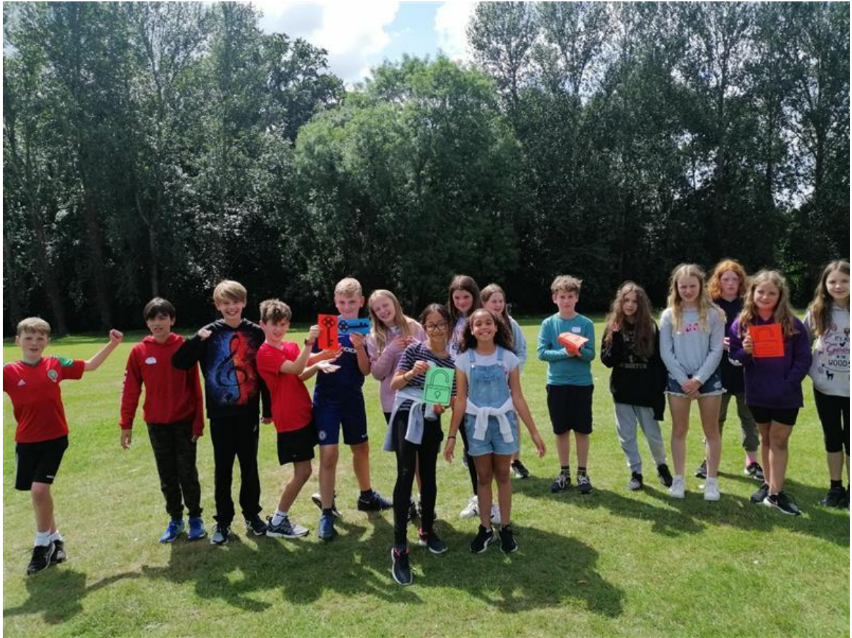
Mapledurham Team Escaped the Room!