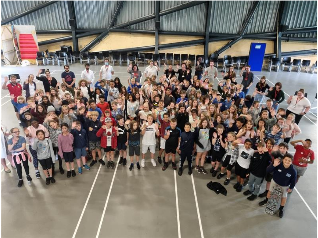
Highdown's Got Talent