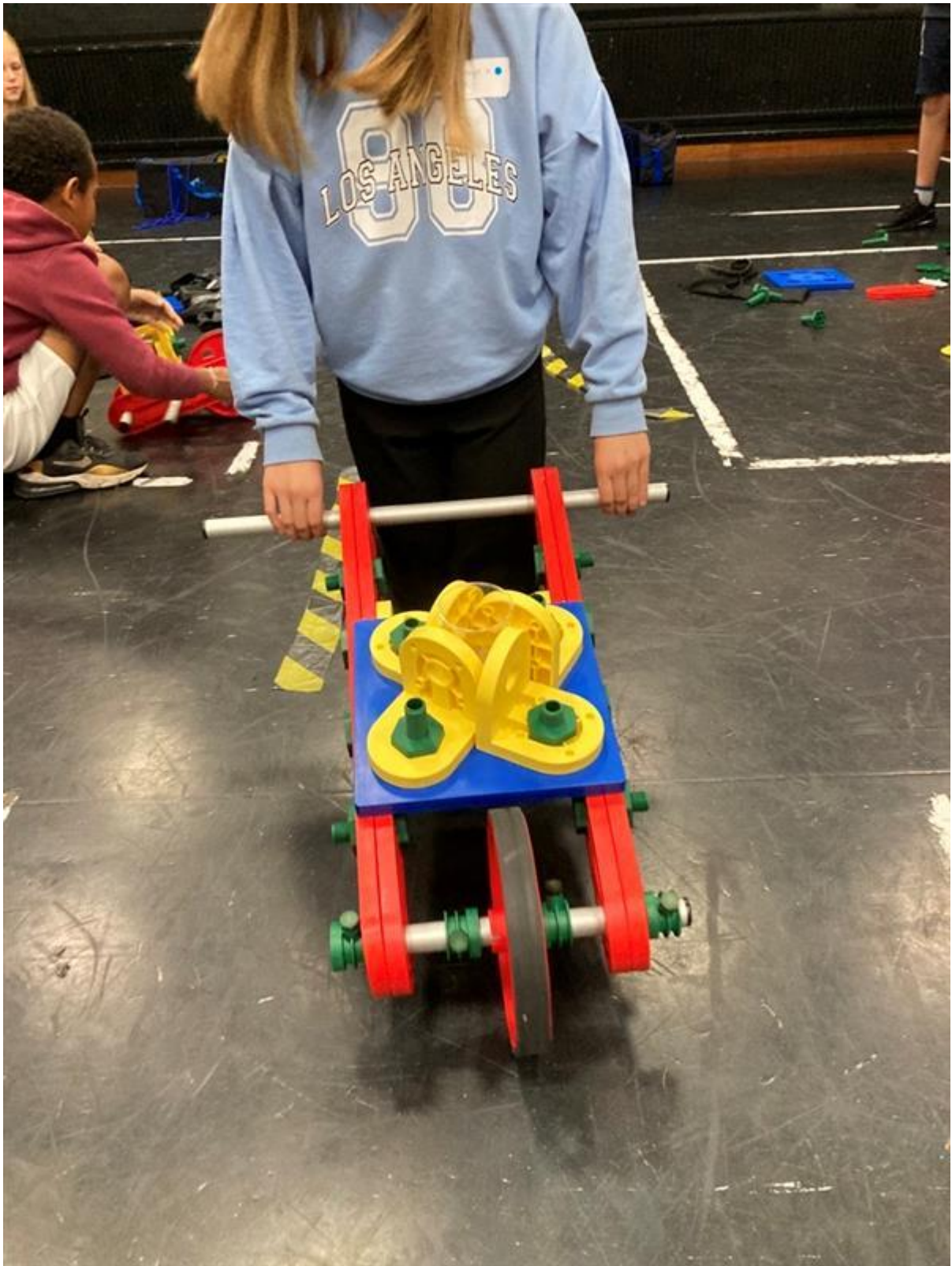
STEM Wheelbarrow challenge with MTA STEM kits