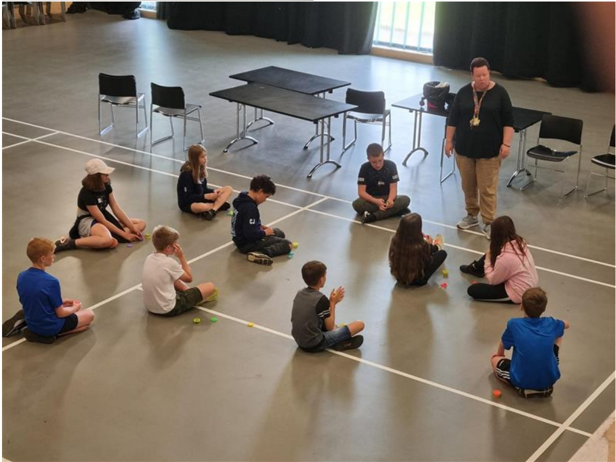
First Aid: Restart a Heart