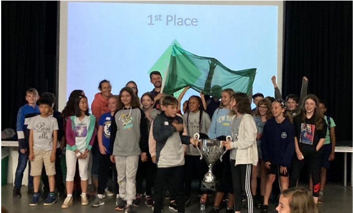
Grove Griffins gain the most House Points across the week!