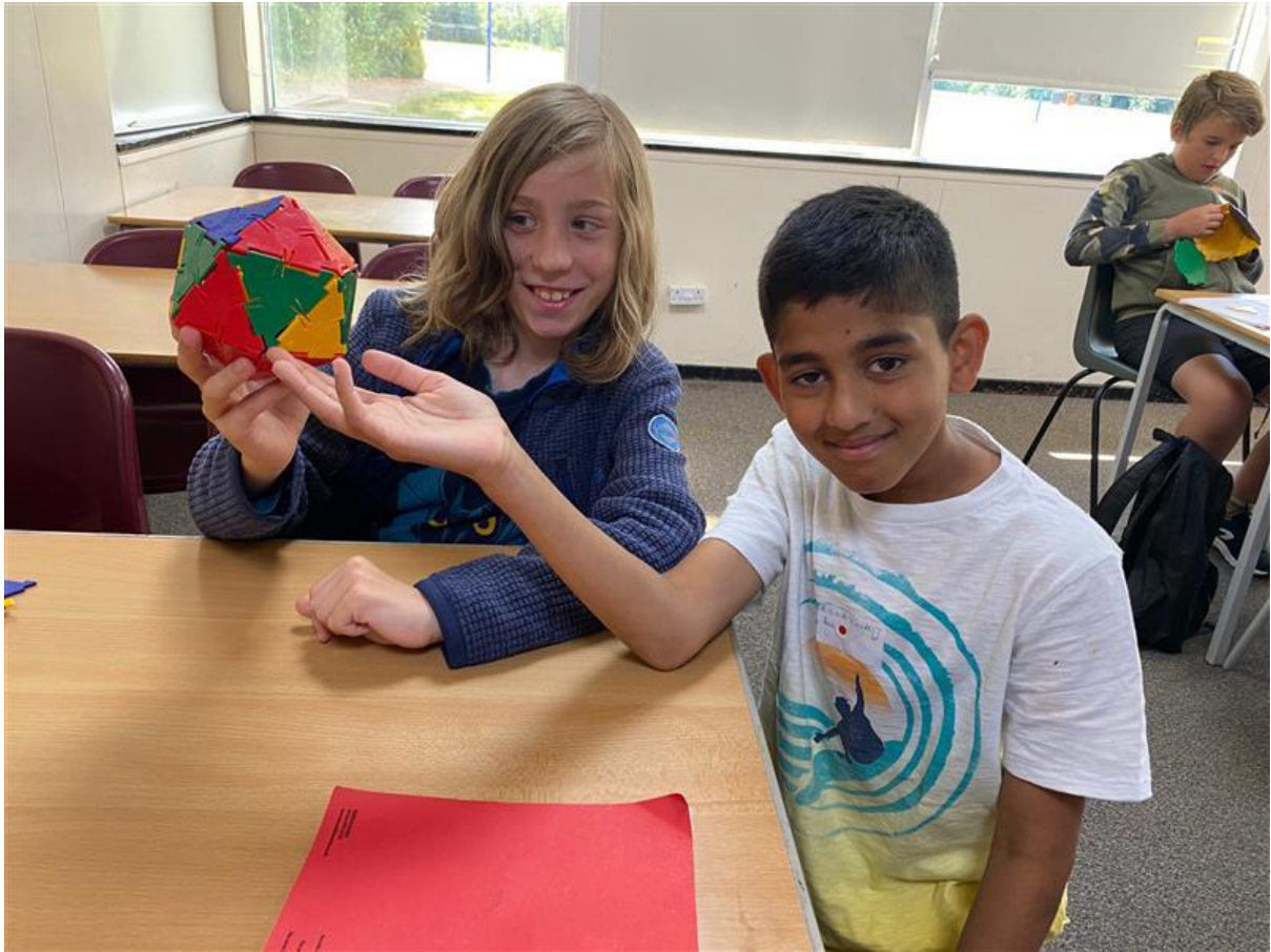
Fun with Maths