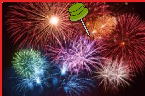
Highdown Fireworks Evening signupgenius.com

We need helpers on the refreshments, gate & marshals for the fireworks event—sign up here!!